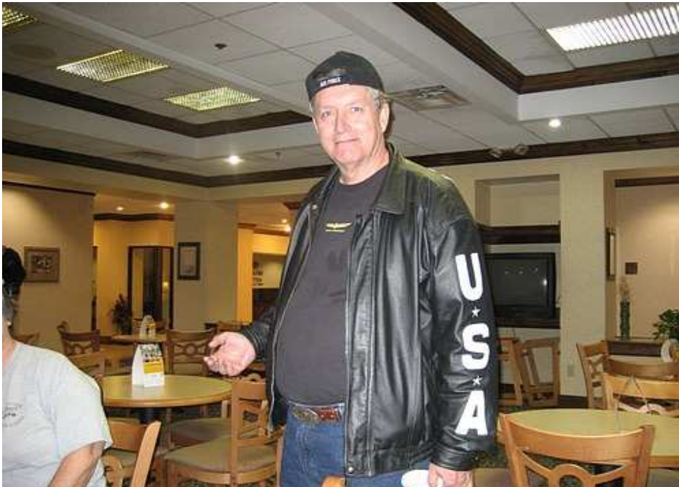
Taking up a collection to buy cigars?