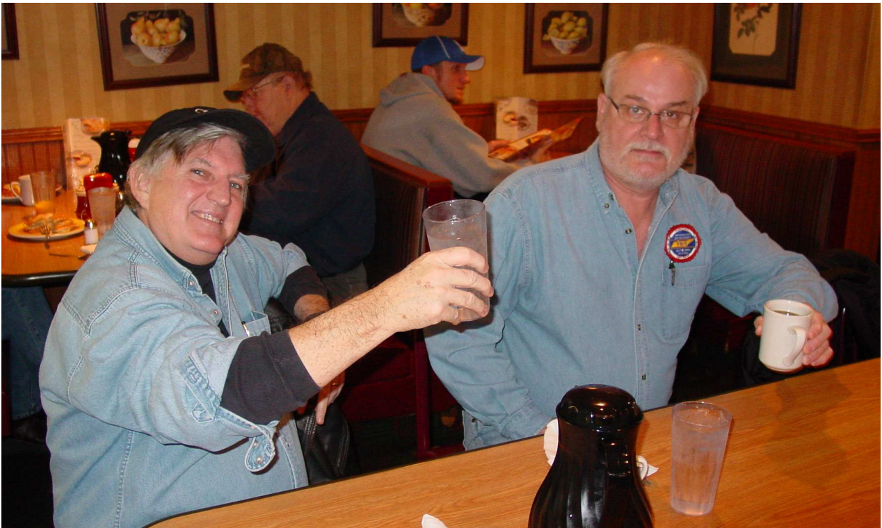
A toast to the New Year!!!