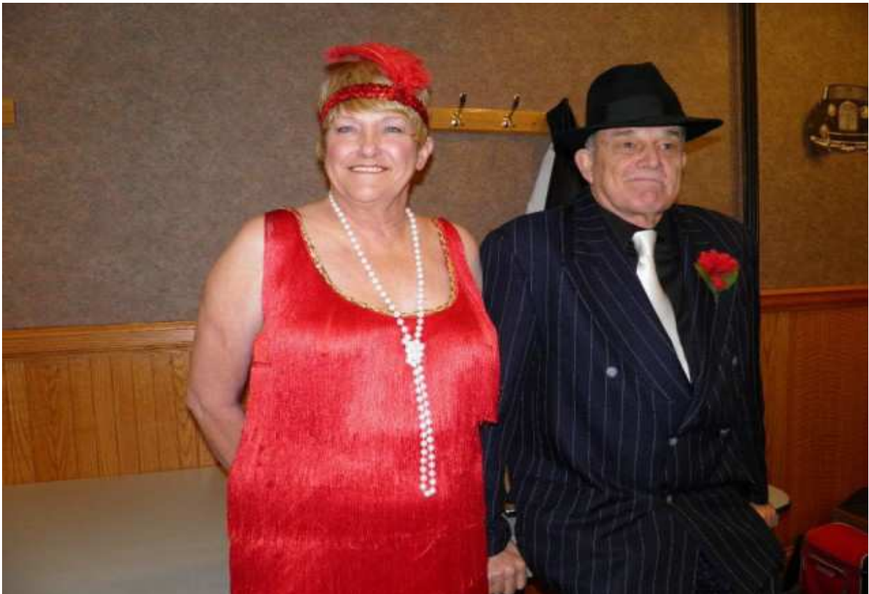
One doll, and one shady character (reprinted from TN District Newsletter)