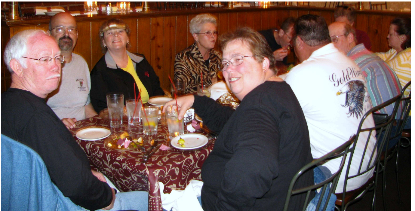
W2'ers enjoying the evening

GWRRR Memphis Gold - W2 9116 Deer Meadow Dr Cordova, TN 38016